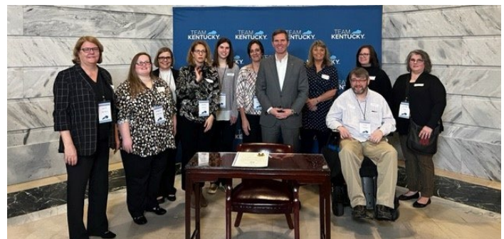
Members of KPIP Class of 2022-2023

"I cannot say enough good things about Partners. I have learned more in eight weekends than I have in eight years of in-service workshops."