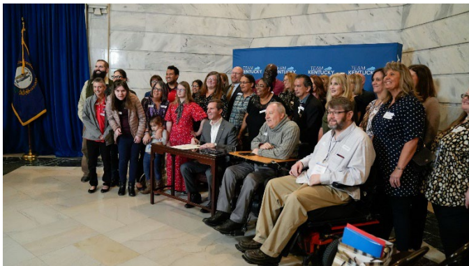
Governor signing proclamation for DD Month

"I had no idea of the opportunities available to people with disabilities. Now I sit on several boards and am an active advocate for the issues that are important to me."