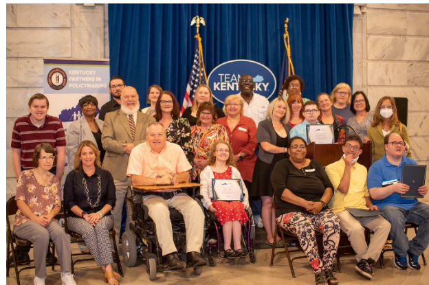
Kentucky Partners in Policymaking Graduates

"I was already an advocate, but Partners increased my knowledge about the legislative process, the ADA, and other issues. My credibility has improved among government and business leaders. I'm consulted on disability issues."