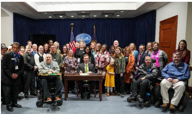
Governor signing proclamation for DD Month 2025

"I had no idea of the opportunities available to people with disabilities. Now I sit on several boards and am an active advocate for the issues that are important to me."