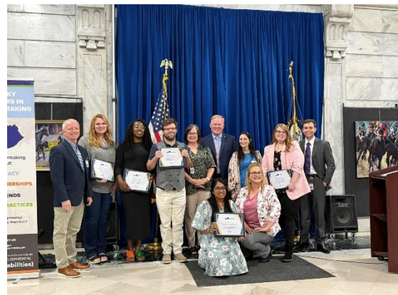
Kentucky Partners in Policymaking Graduates 2025

"I was already an advocate, but Partners increased my knowledge about the legislative process, the ADA, and other issues. My credibility has improved among government and business leaders. I'm consulted on disability issues."