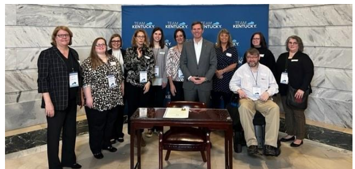
Members of KPIP Class of 2022-2023

"I cannot say enough good things about Partners. I have learned more in eight weekends than I have in eight years of in-service workshops."